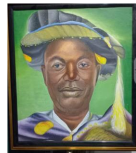
Figure 6: Conventional oil painting