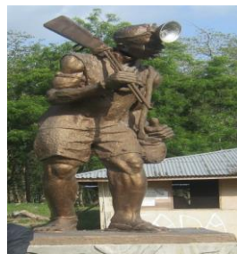
Figure 11: Ogboju Ode, (Finished work)

Case Study 1: Ogboju- Ode by Seyi-Gbangbayau Paul S.