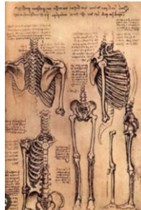
Figure 2: Study of anatomy