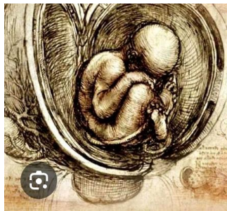
Figure 1: Anatomical drawing

disciplines, reshaping artistic practices and audience engagement. In the Nigerian context, digital technology has also made notable inroads, particularly in fields like graphic design and photography. However, its integration into sculptural art remains relatively limited. Despite the emerging potential of kinetic and functional sculptures—art forms that incorporate movement, interactivity, and digital elements—only a few Nigerian sculptors have begun to explore these innovative possibilities. This study examines the impact of digital transformation on Nigerian Art and Design, with a particular focus on sculpture.