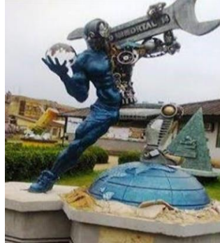
Figure 13: Tomorrow, Metal and Fibre glass, 12ft, Oyu, Nigeria, (John, 2012)

A mechanized sculpture symbolizing the intersection of art and technology. It features moving parts and illuminated eyes, reflecting themes of progress and innovation.