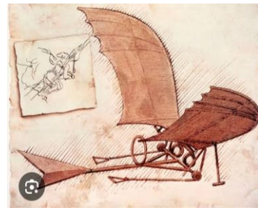
Figure 3: Engineering drawing of da Vinci

Figures 1 and 2 are some of the scientific drawings of Leonardo da Vinci Photography Courtesy: artlyst.com , 2025