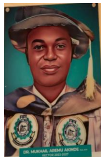
Figure 5: Digital painting